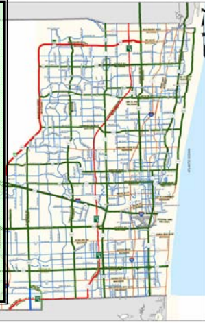
BROWARD COUNTY MAJOR CORRIDORS