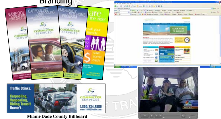
Miami-Dade County Billboard